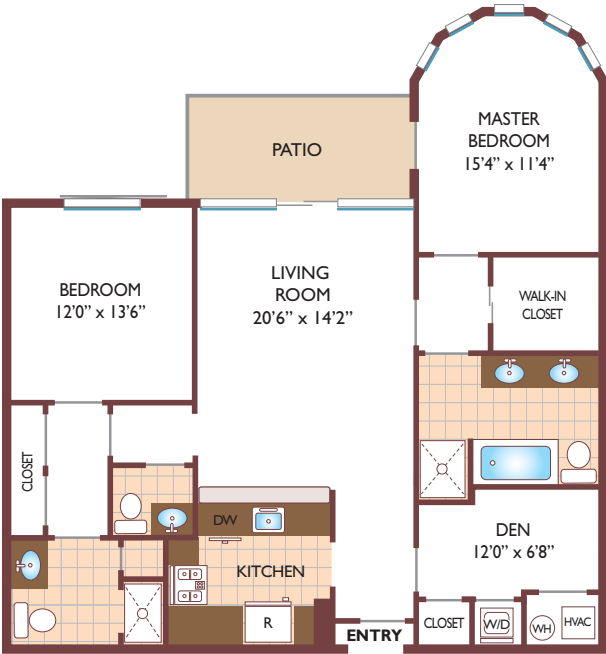
Two Bedroom Floor Plan A with 2 & 1/2 Baths, 1536 sq. ft.