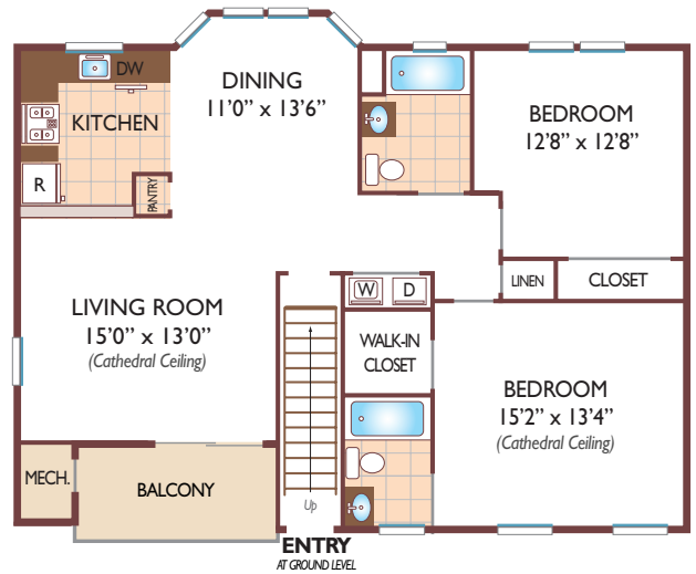
Two Bedroom Floor Plan The Fairfax - Second Floor with 2 Baths, 1400 sq. ft.