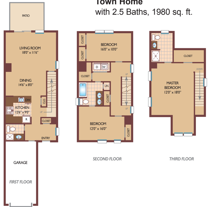
The Redwood Three Bedroom Floor Plan Town Home with 2.5 Baths, 1980 sq. ft.