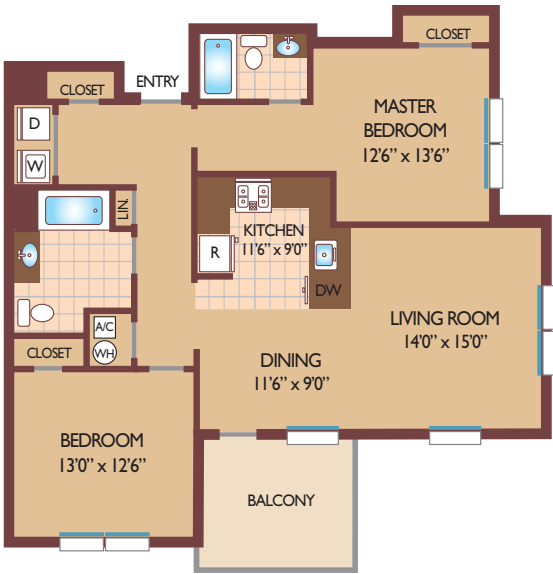
The Dogwood Two Bedroom Floor Plan with 2 Baths, 1200 sq. ft.