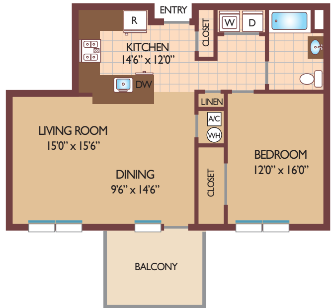
The Cedar One Bedroom Floor Plan with 1 Bath, 960 sq. ft.