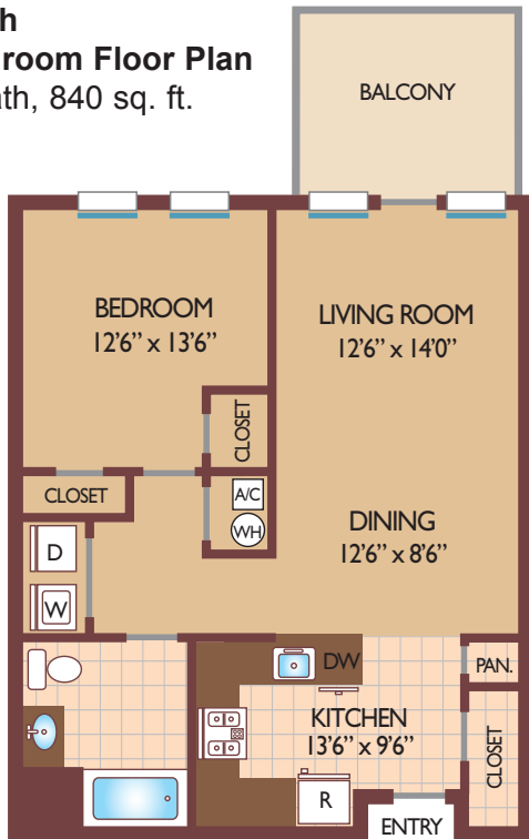
The Birch One Bedroom Floor Plan with 1 Bath, 840 sq. ft.