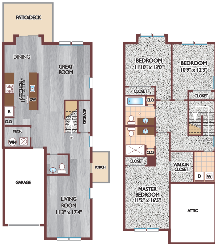
Two Bedroom Floor Plan with 2.5 Bath, 2161 sq. ft.