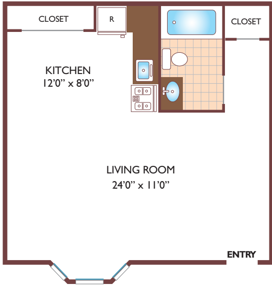
Studio Floor Plan with 1 Bath, 440 sq. ft.