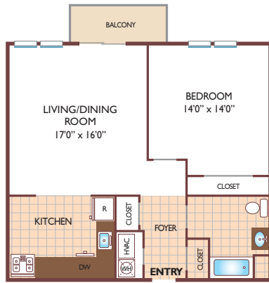
One Bedroom Floor Plan Model 2B with 1 Bath, 850 sq. ft.