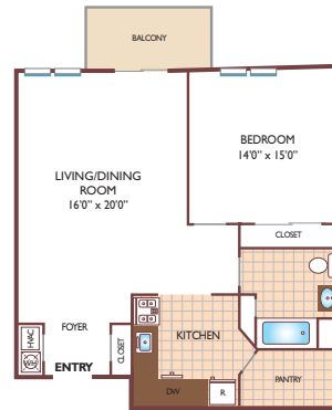
One Bedroom Floor Plan Model 1D with 1 Bath, 970 sq. ft.