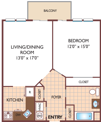
One Bedroom Floor Plan Model 2A with 1 Bath, 750 sq. ft.