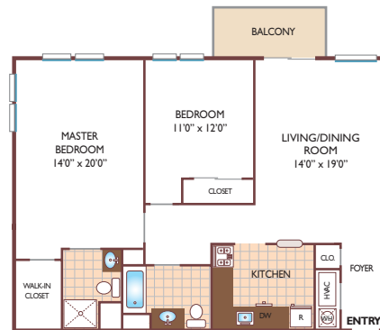
Two Bedroom Floor Plan Model 1E with 2 Baths, FGFI sq. ft.