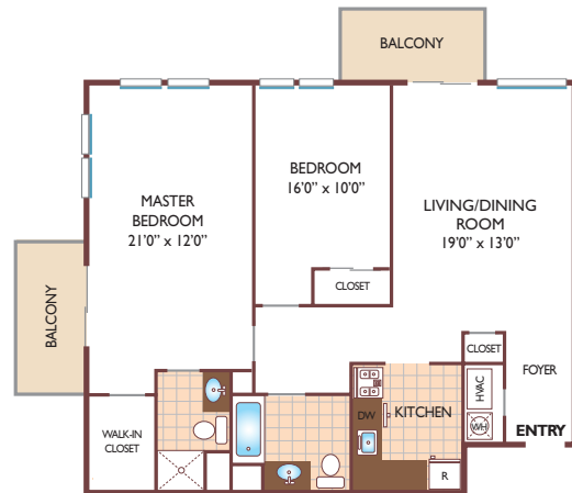
Two Bedroom Floor Plan Model 2E with 2 Baths, 1105 sq. ft.