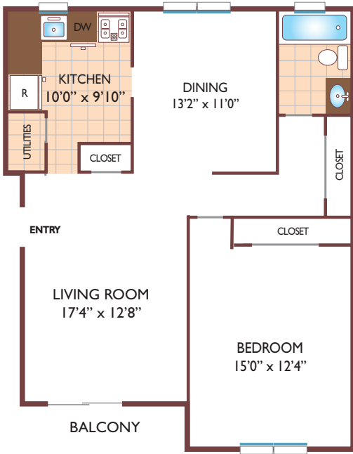
One Bedroom Floor Plan Unit B with 1 Bath, 915 sq. ft.