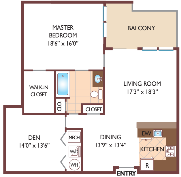
One Bedroom w/ Den Floor Plan with 1 Bath, 1270 sq. ft.