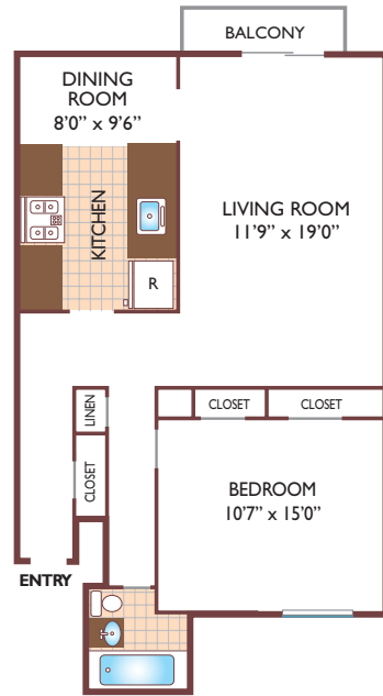
One Bedroom Floor Plan Large with 1 Bath, 765 sq. ft.