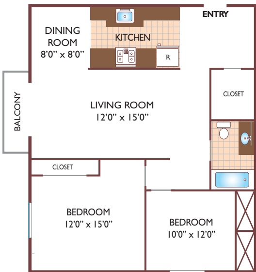
Two Bedroom Floor Plan Standard with 1 Bath, 910 sq. ft.